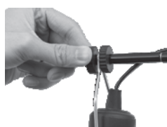
Hang on the dome lamp between the rubber rings.

Lamp holder. Can be hung at different heights thanks to its fixing device. Includes a metal clip for suspension. Metal bracket accommodates dome-shaped fixtures. Eliminates the need of placing dome lamps on the mesh top. Easily adjusts the position of the lamps at different heights. Helps to achieve optimum temperature and ultraviolet output.