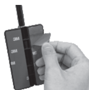
Take off the sticker on the back of the fixation piece.