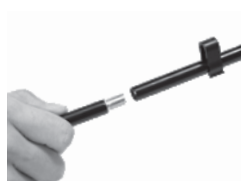
Extend the iron pipe.