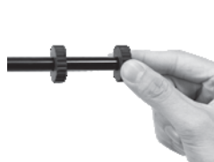
Install the rubber rings.