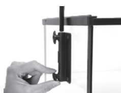
Lock the nuts.