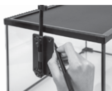
Remark the fixation position.

Note: Non-contractual photo. Dome lamp not included.